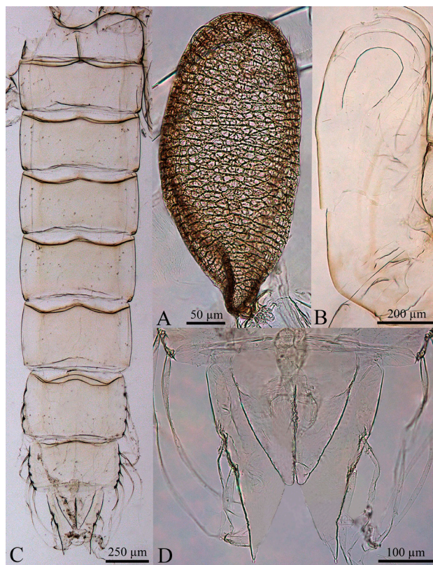
Figure 1. Ablabesmyia cordeiroi Neubern, pupa. (A) thoracic horn; (B) wing sheath; (C) abdomen; (D) anal lobe. This figure is in color in the electronic version.

Coloration. Head capsule yellow; post-occipital margin brown; antenna and maxillary palp yellowish; mandible yellow with brown apex; ligula brown at apex. Abdomen yellowish;